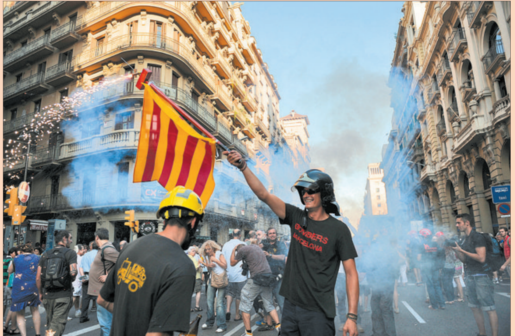
Inflammatory talk: firemen in Barcelona protest against austerity measures. The ruling Partido Popular has dropped hints about curbing the power regions such as Catalonia acquired following Franco's dictatorship

Mr Montoro has made clear that governments seeking help to refinance their debts through the new €18bn liquidity fund for the regions will have to accept strict conditionality of the type the EU enforces on